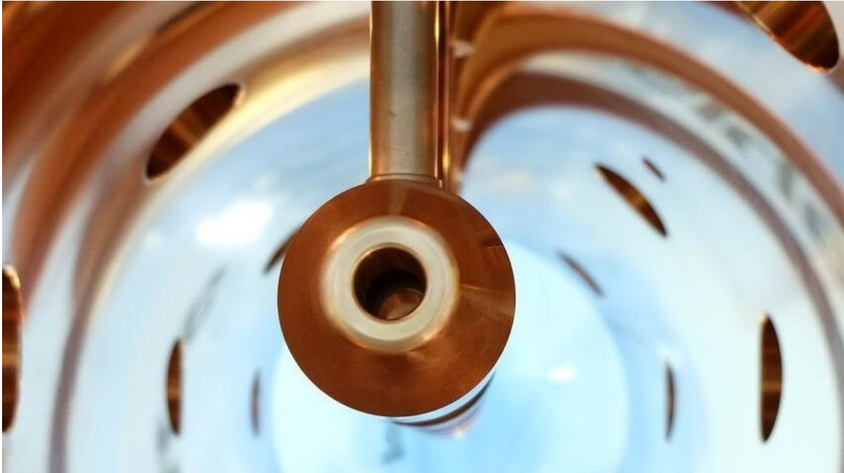
The Drift Tube Linac (DTL) of the European Spallation Source (detail)