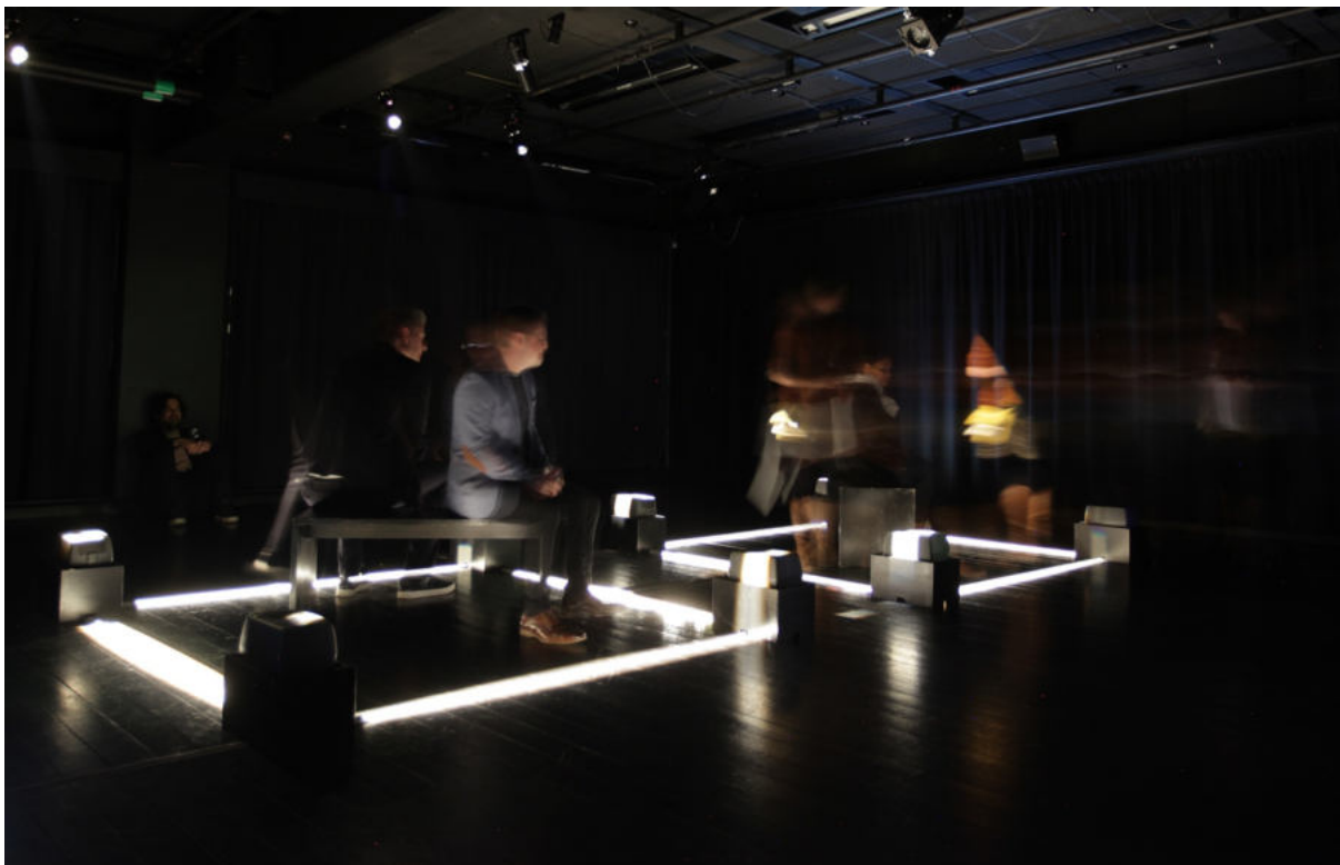
Ish S, Two Squares, Nanocosmic Investigations. The Exhibition. 5 April 2022