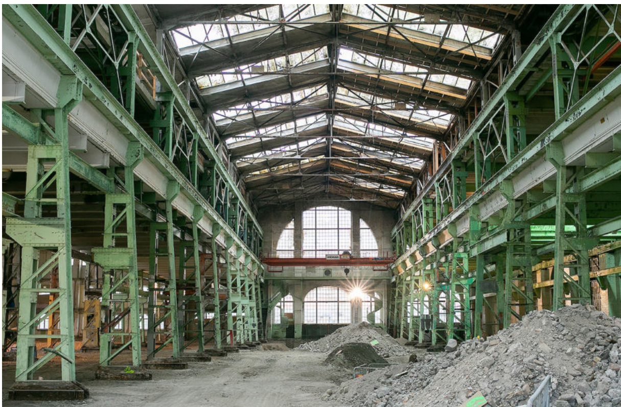
Varvsstaden, Kockum's old industrial area, Marge Arkitekter

Antifascism: electronic music from worlds on fire. (17 September, Kulturnatten, Lund) Location: Pufendorf Institut. The concert was organised by The Sound Environment Centre in collaboration with Pufendorf IAS and technical support by IAC.